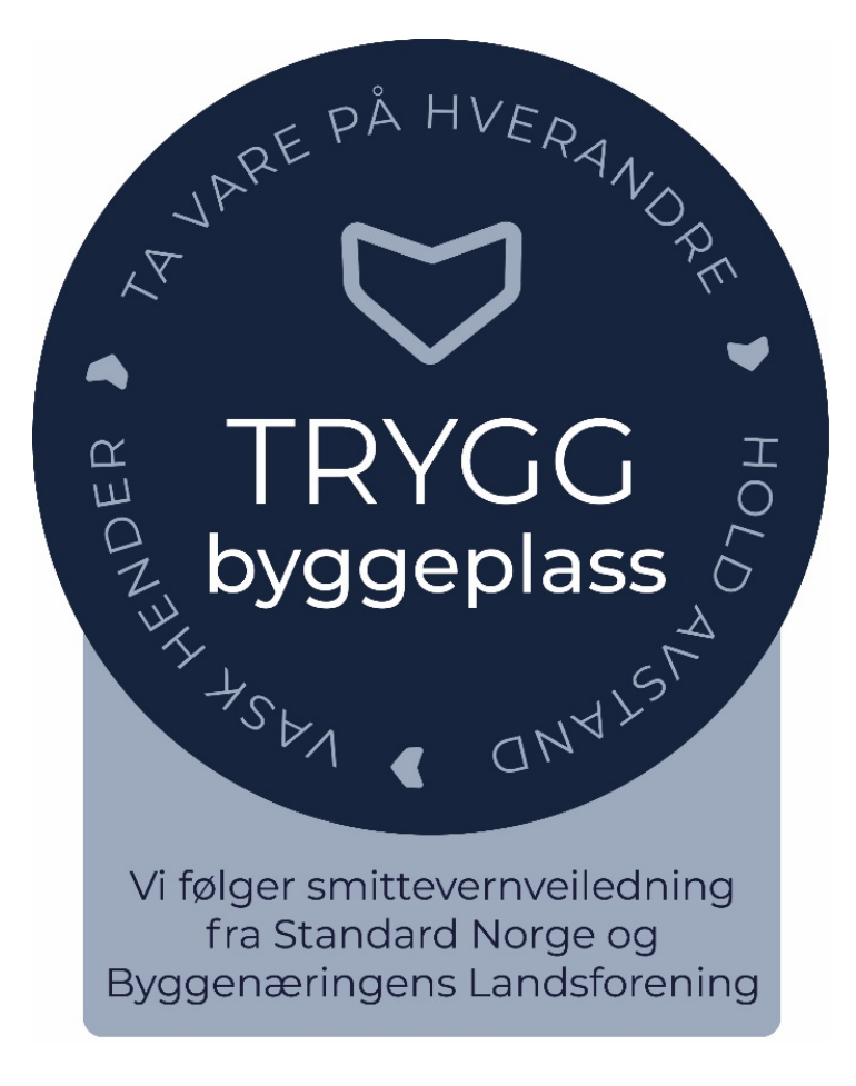
Figure 2 — Safe building site

Enterprises that undertake to follow the rules and implement the measures set out in this document may use the emblem shown in Figure 2.